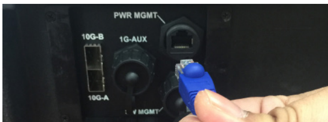
The Connections on the rear of the MDC SR-10